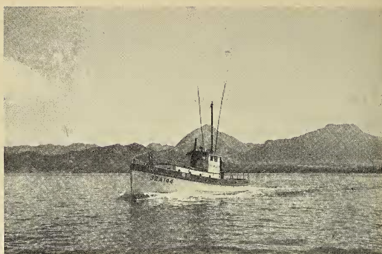
FIG. 6. The Salpa .

The field equipment includes the 46-foot research vessel, the Salpa (Fig. 6), which has a live well with circulating sea water and hoisting gear for dredging, hauling plankton nets, and hydrographic work. Gear such as dredges, seines, and nets of various sorts, traps, plankton nets from small to meter-size